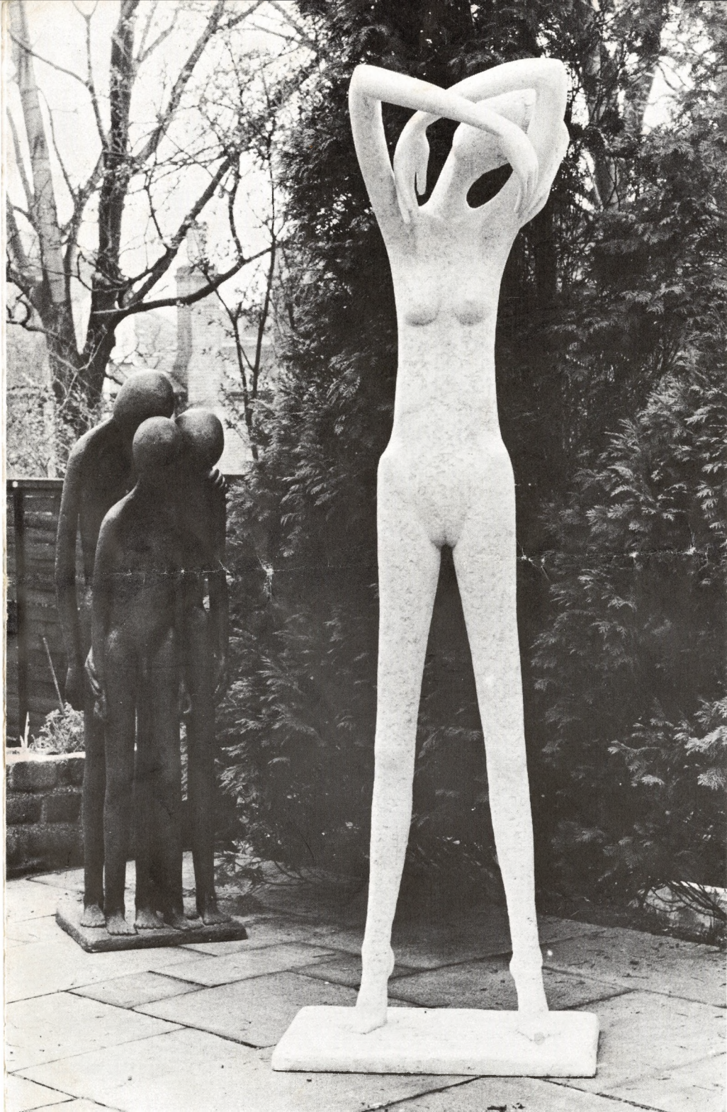
Sculpture by Nenne van Dijk