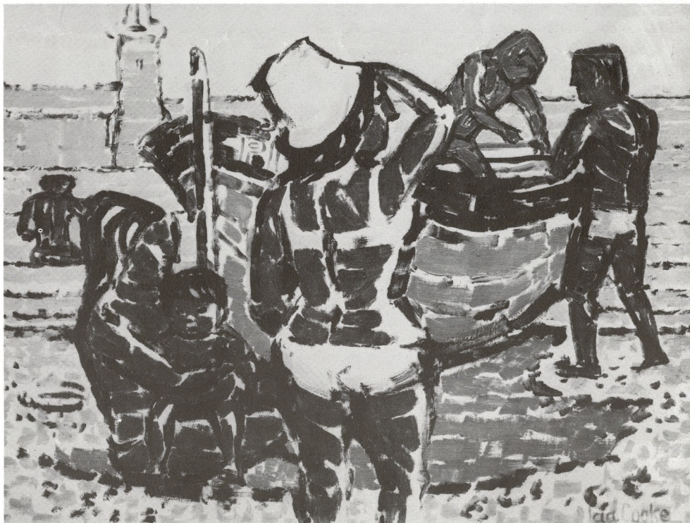
Collioure Beach by Ida Cooke